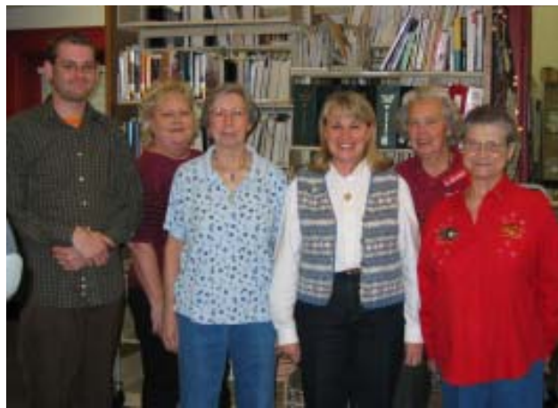
Some of the helpful PSPL Circulation Desk staff (from left to right):